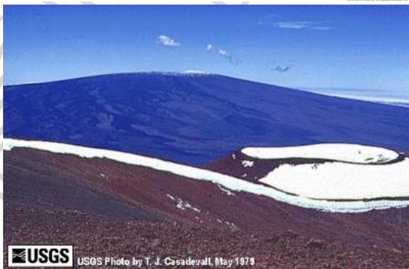
Mauna Loa, a shield volcano, in Hawaii