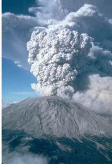
Mt. St. Helens, a stratovolcano, erupted in 1980 in Washington State

Lava makes its way from deep in the crust to the surface through a tube called the vent . At the top of many volcanic vents is a cone-shaped depression called a crater. From the volcano, lava can flow out of the vent and become part of a lava flow. The chamber, the magma chamber, is called a magma chamber.