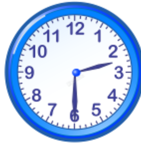
half past 2